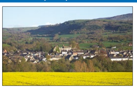
Tranguil setting overlooking the River Wye. 5 minutes walk from the centre of town. Ideal for Offa's Dyke and Wye Valley walkers.